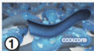
1 Wicking to move sweat from your body