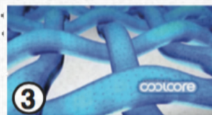
3 Fibers regulate evaporation to prolong cooling effect