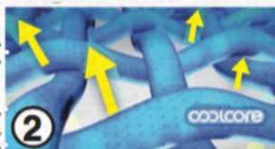
2 Moisture transportation to avoid saturation & accelerate drying